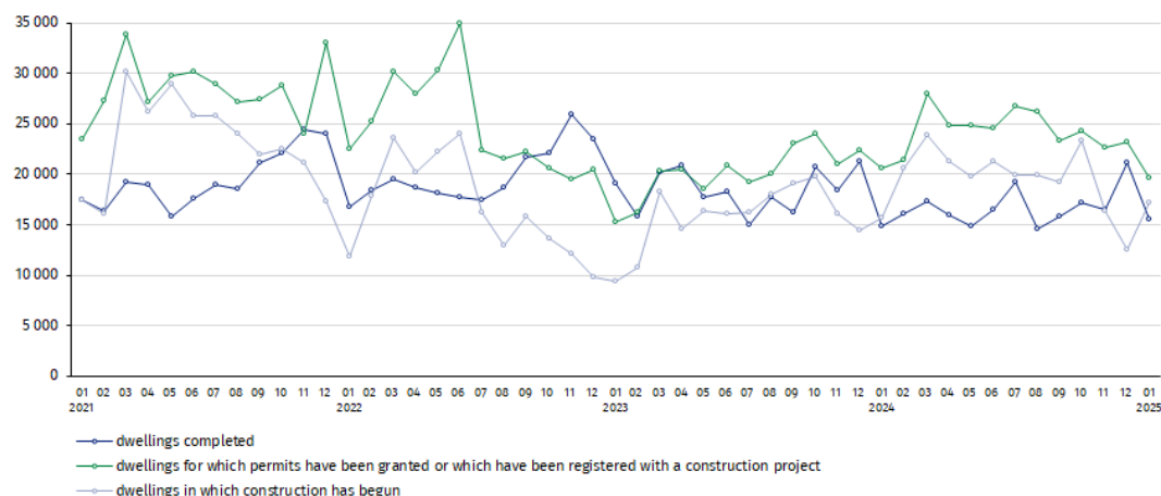
Chart 1. Residential construction in Poland

In January 2025, compared to December 2024, the number of dwellings completed as well as the number of dwellings for which permits have been granted decreased (by 26.8% and 15.5%, respectively), whereas the number of dwellings in which construction has begun increased (by 37.0%).