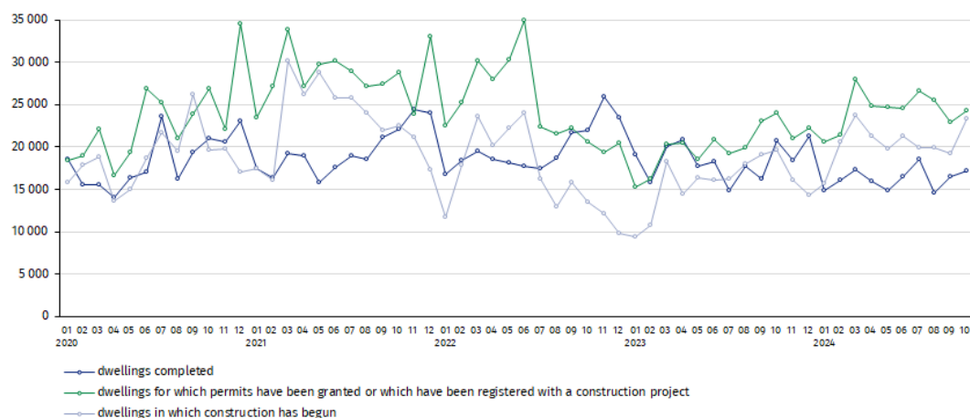
Chart 1. Residential construction in Poland

In October 2024, compared to the previous month, the number of dwellings completed, the number of dwellings for which permits have been granted or which have been registered with a construction project as well as the number of dwellings in which construction has begun increased (by 3.3%, 5.9% and 21.4%, respectively).