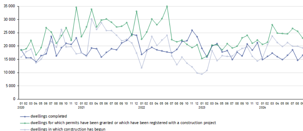
Chart 1. Residential construction in Poland

In September 2024, compared to the previous month, the number of dwellings completed increased (by 13.7%), whereas the number of dwellings for which permits have been granted or which have been registered with a construction project as well as the number of dwellings in which construction has begun decreased (by 10.1% and 3.3%, respectively).