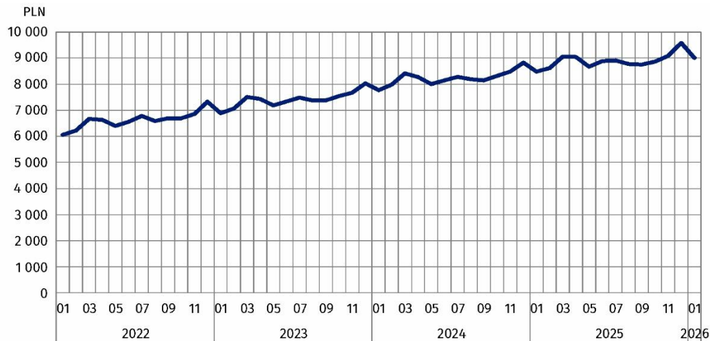
Chart 2. Average monthly gross wage and salary in the enterprise sector

Average monthly gross salary in the enterprise sector includes the base salary and additional salary components, including bonuses, awards, overtime pay and retirement severance pays